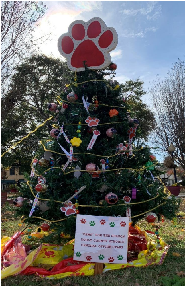
Dooly County School System Central Office Staff – 3 rd Place "Paws" for the Season