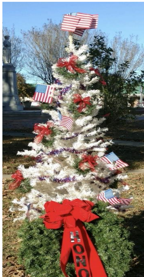
Vienna Woman's Club