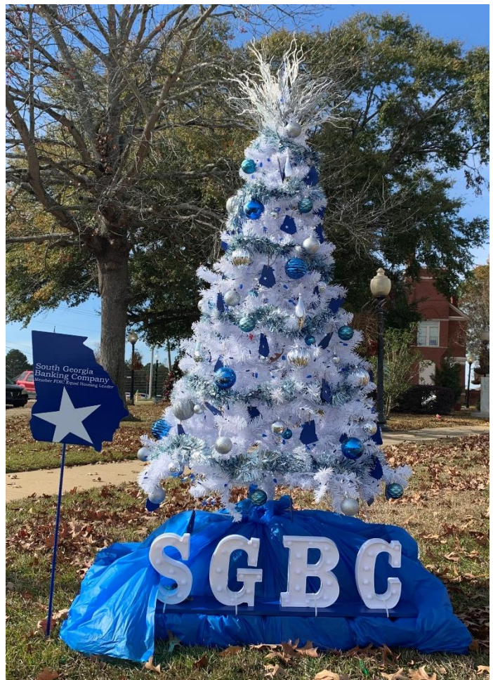
South Georgia Banking Company